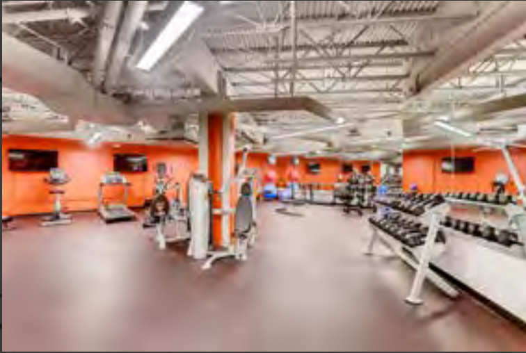
expansive FITNESS CENTER