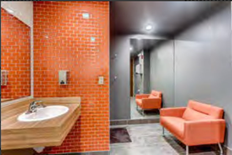
new SHOWERS & LOCKERS