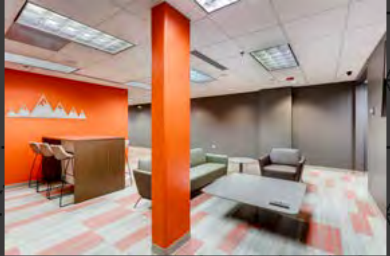
modern TENANT LOUNGE