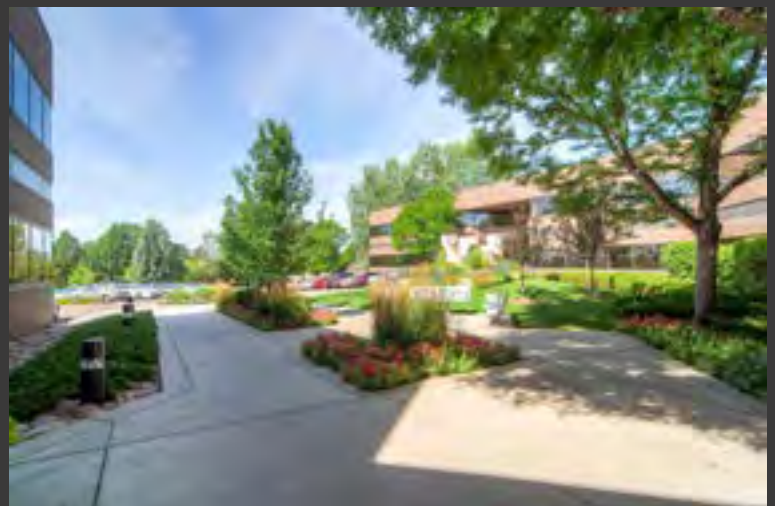
incredible CAMPUS LANDSCAPING