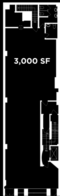
GROUND FLOOR - SIXTH FLOORS 3,000 SF 11 FT CEILINGS