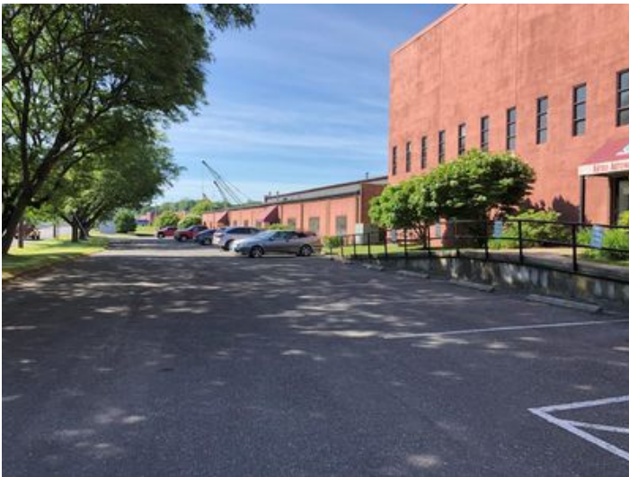
93 Triangle Street