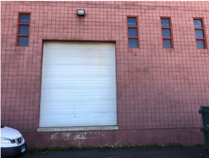
93 Triangle Street