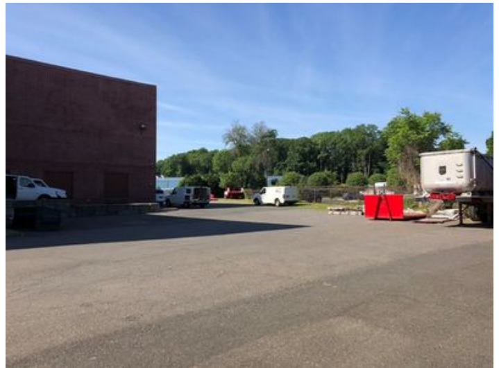
93 Triangle Street