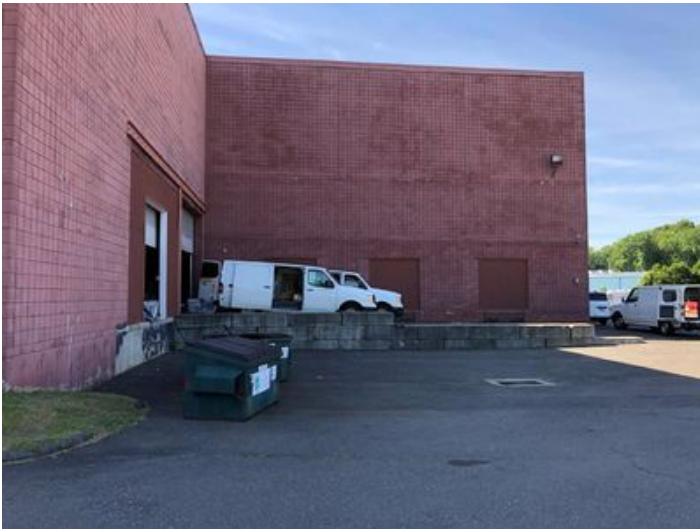
93 Triangle Street