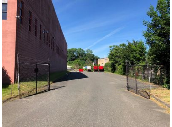
93 Triangle Street