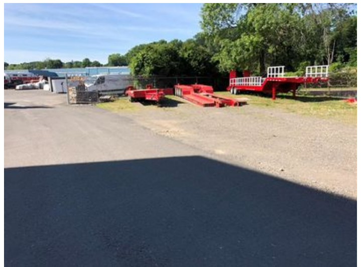
93 Triangle Street