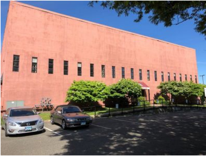
93 Triangle Street