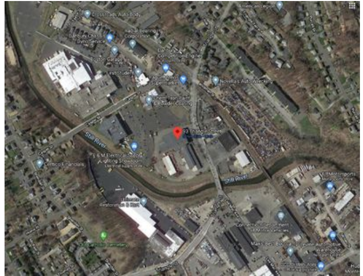
93 Triangle Street