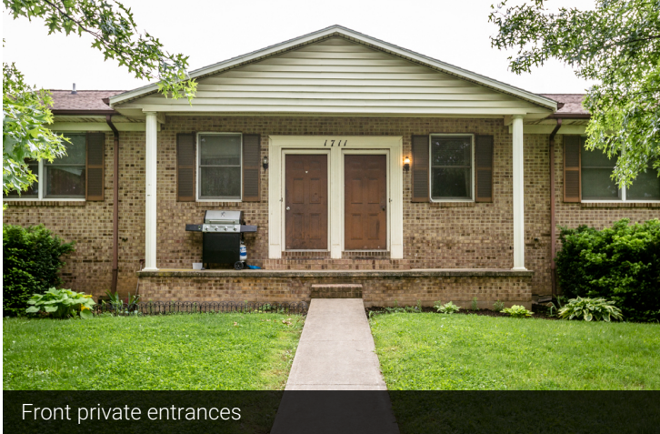
Front private entrances