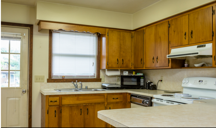
One of 4 Kitchens