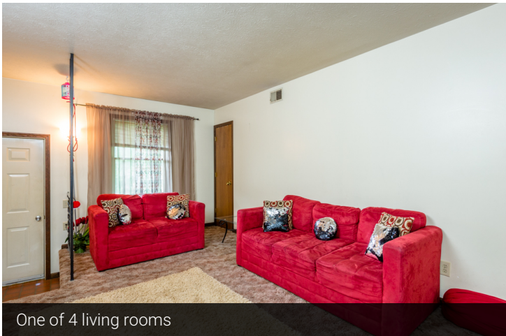
One of 4 living rooms