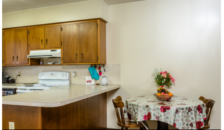
One of 4 dining areas