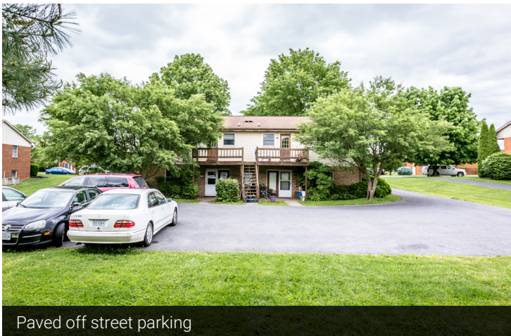
Paved off street parking