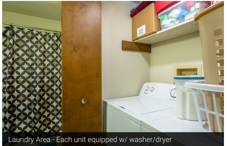
Laundry Area - Each unit equipped w/ washer/dryer