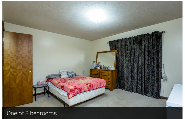
One of 8 bedrooms