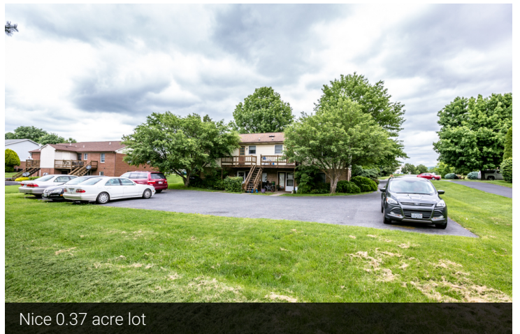
Nice 0.37 acre lot