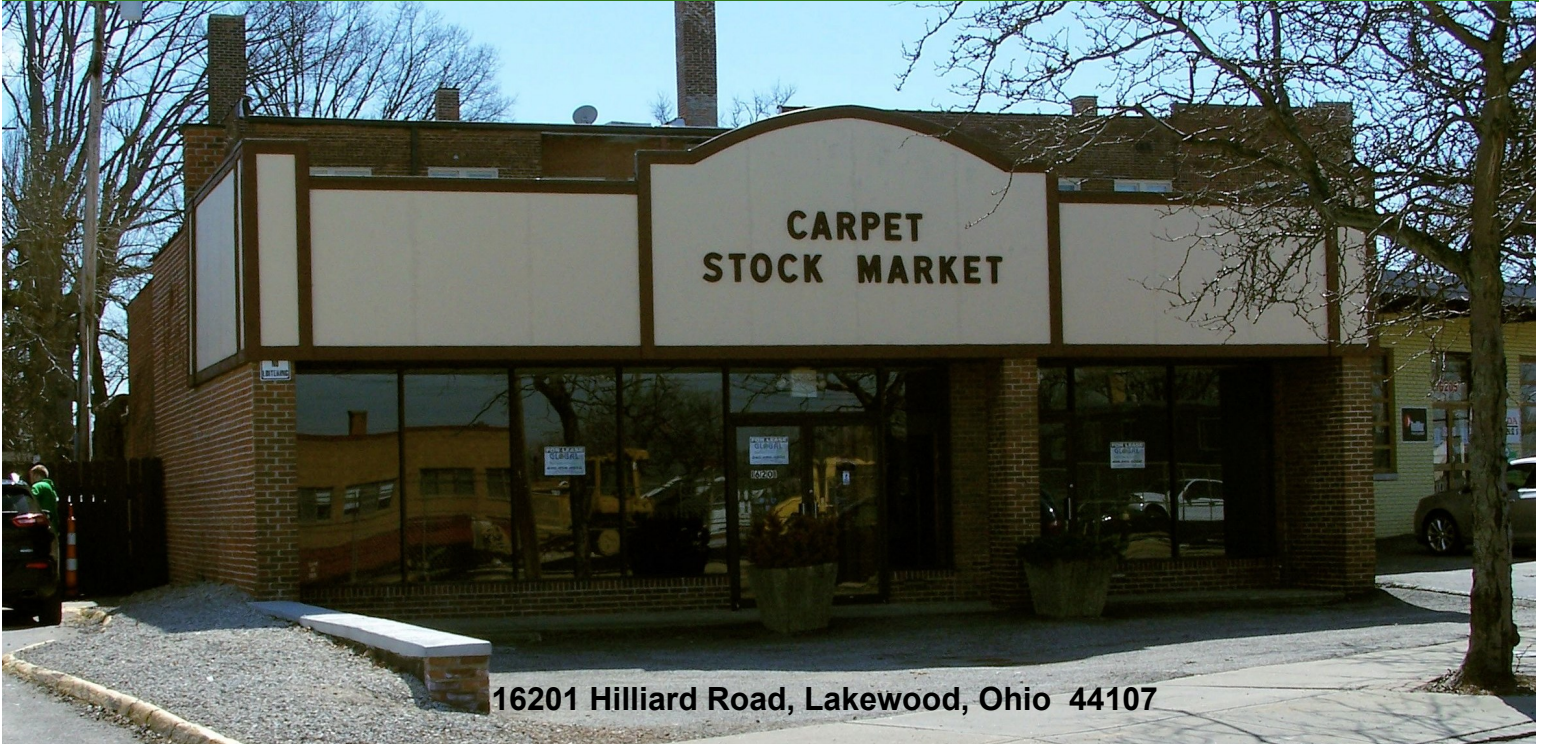
16201 Hilliard Road, Lakewood, Ohio 44107