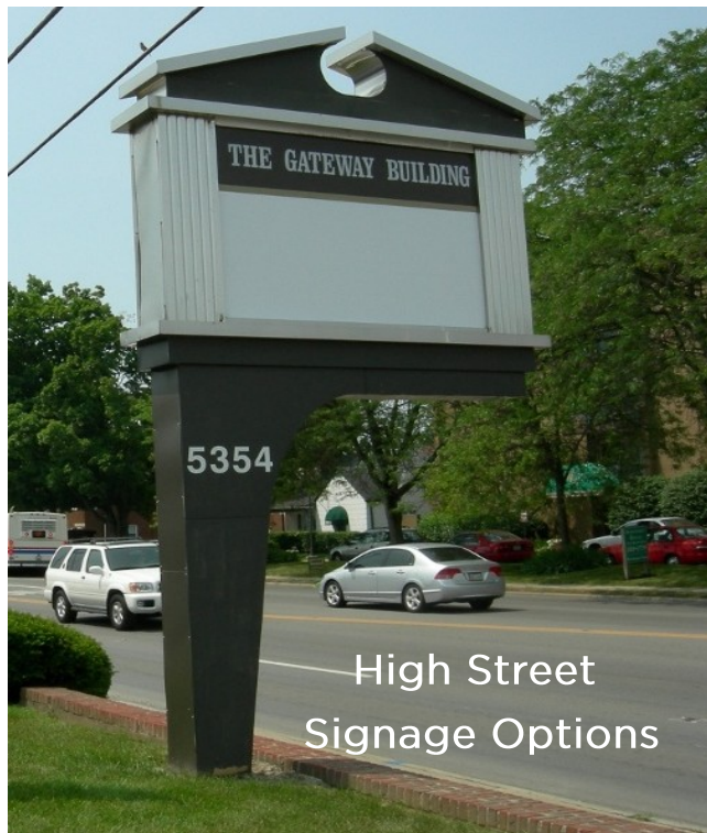
High Street Signage Options