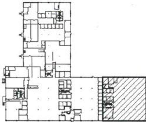
Key Plan - First Floor