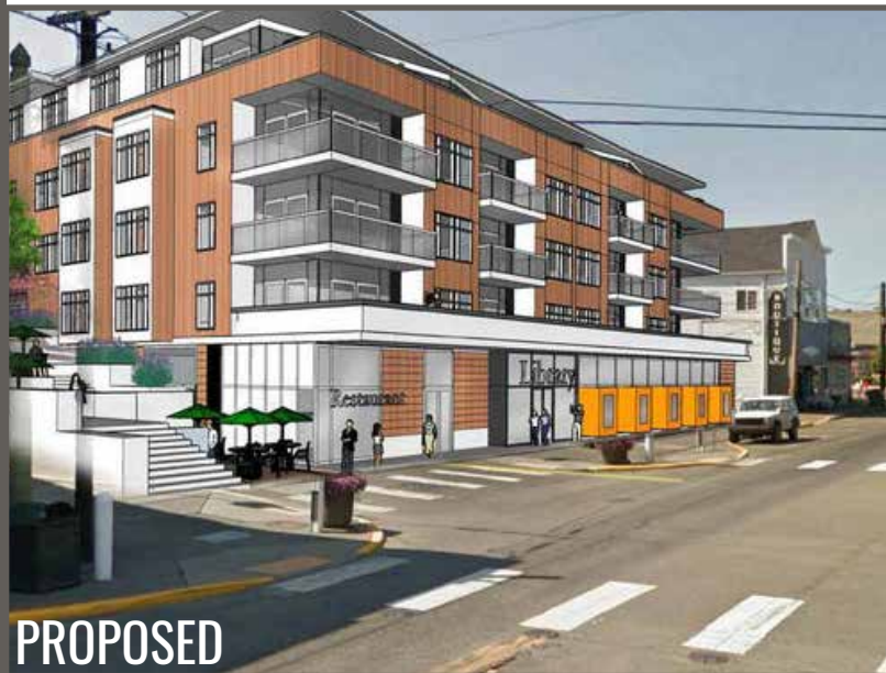
PROPOSED 640 BAY ST BUILDING