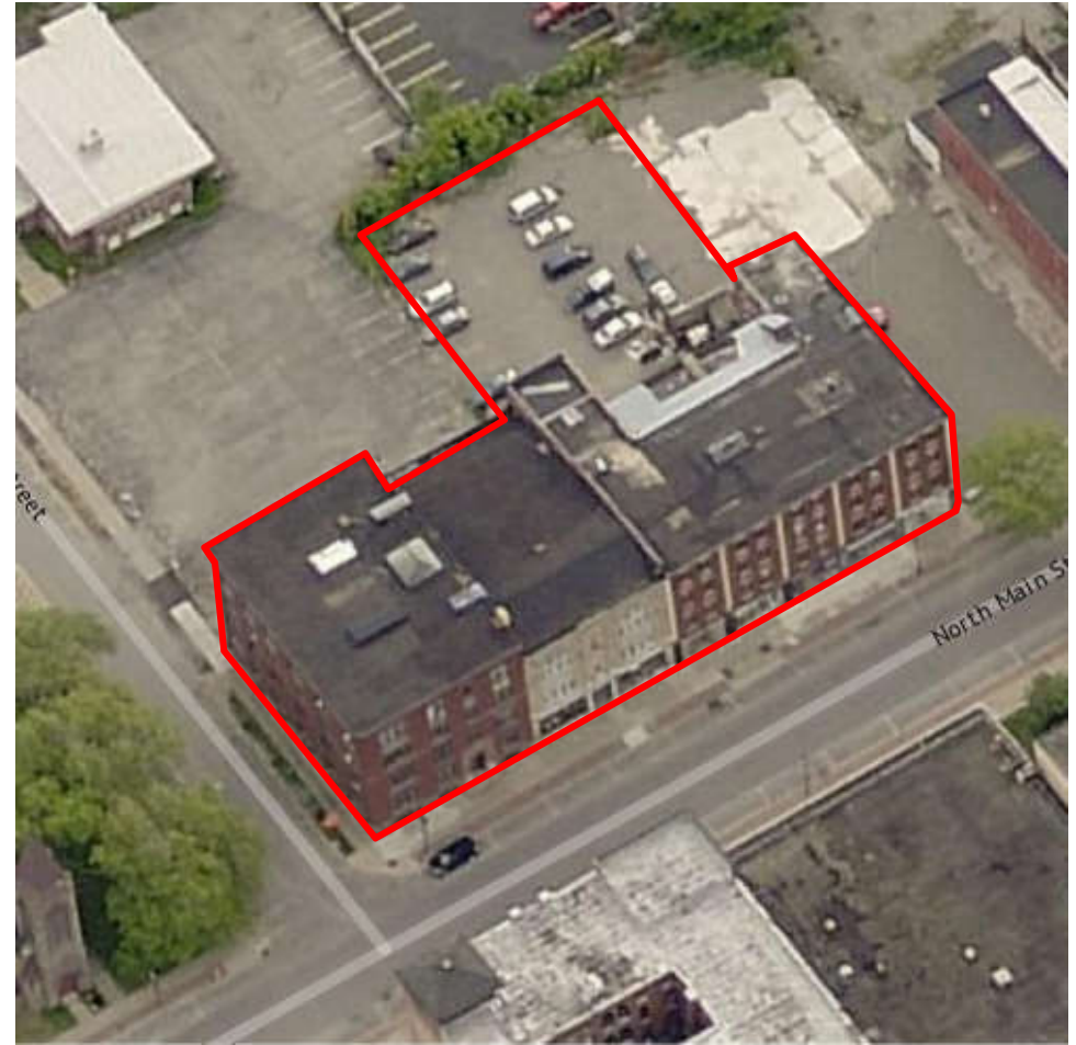
All Plot Lines Subject to Verification of Survey