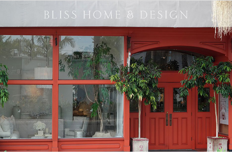
BLISS HOME & DESIGN