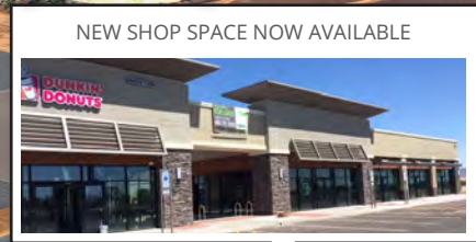
NEW SHOP SPACE NOW AVAILABLE

Single Family Rental ±290 Homes Under Contract