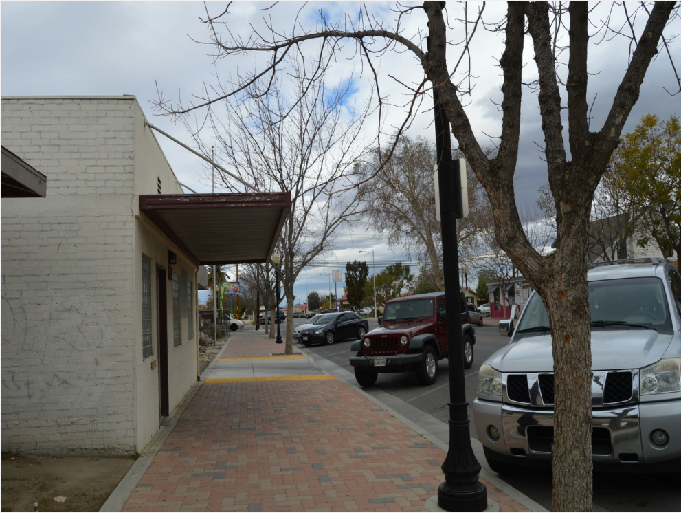
STREET VIEW 2