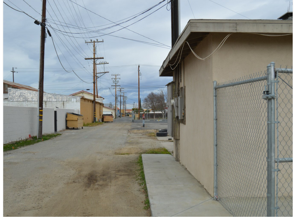
BACK VIEW BUILDING