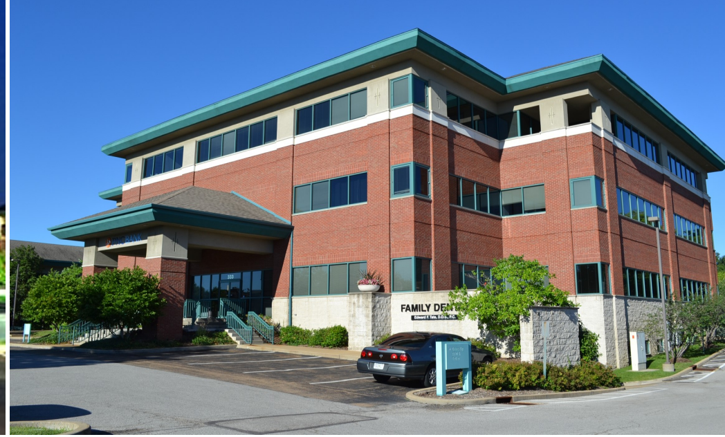
333 S. Kirkwood Road Kirkwood, MO 63122