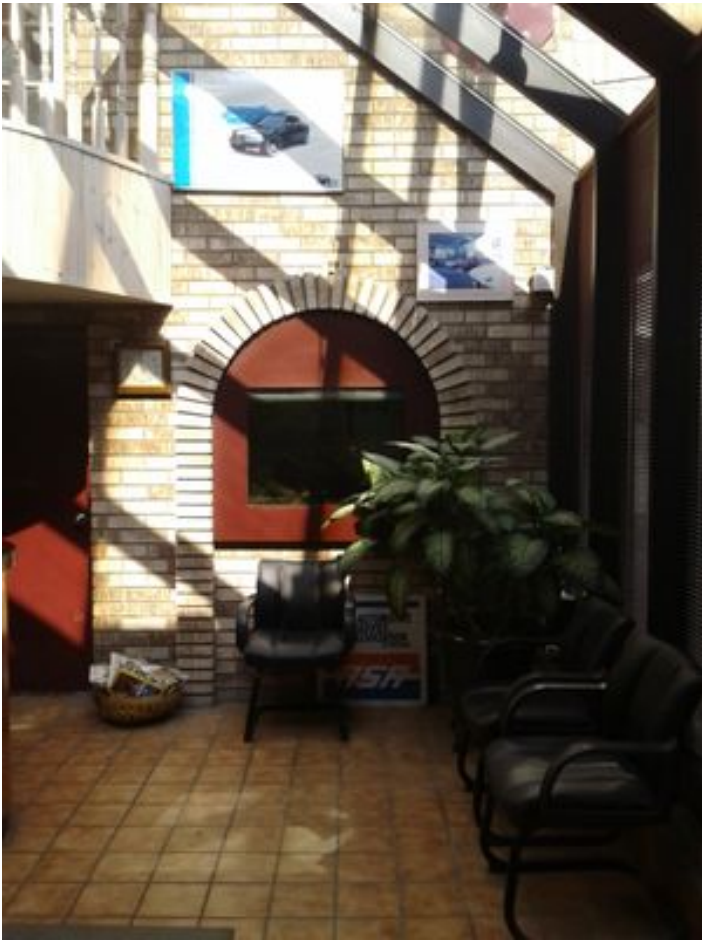
Office View 3