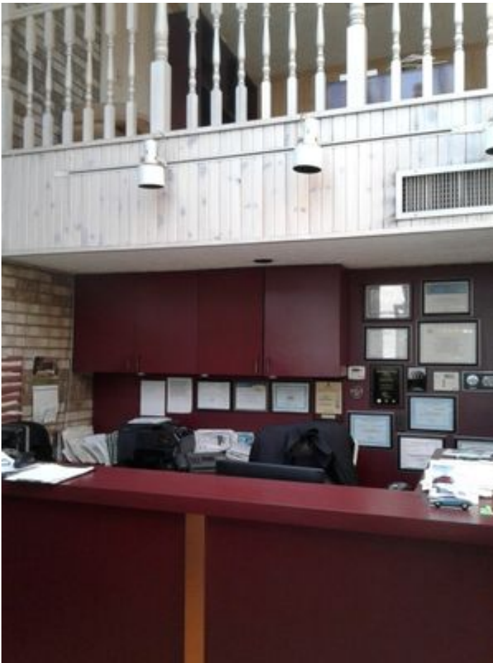
Office View 1