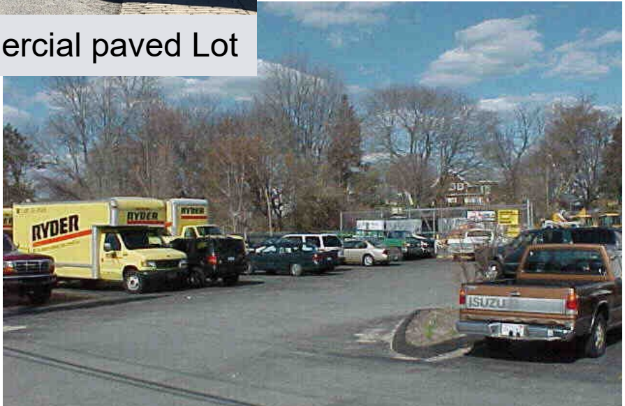
567 Colman St. - Commercial paved Lot