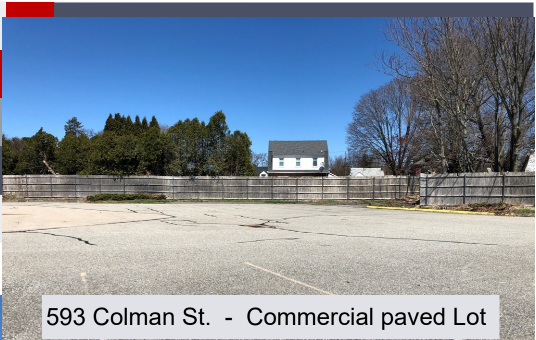
593 Colman St. - Commercial paved Lot