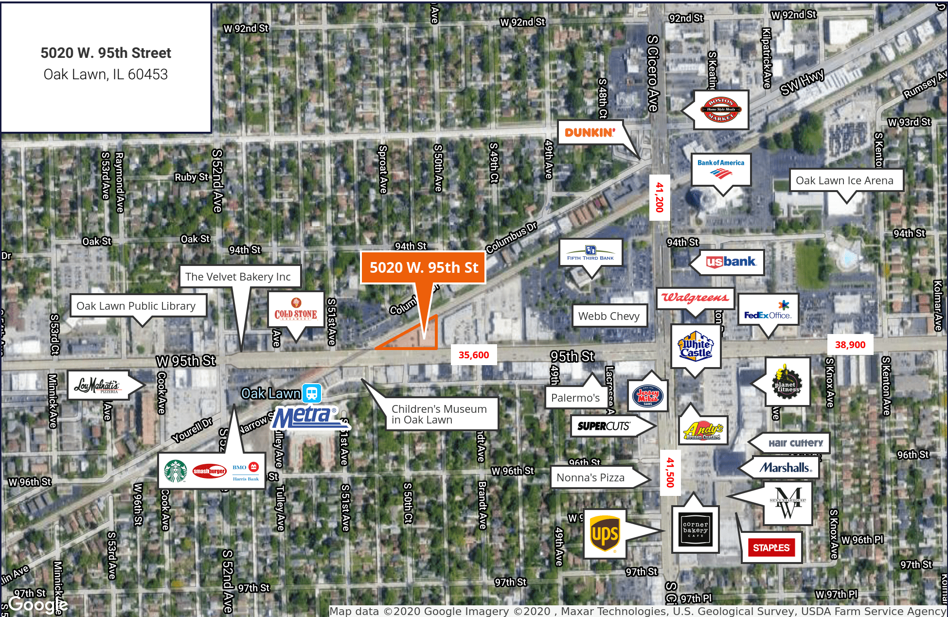
Map data ©2020 Google Imagery ©2020 , Maxar Technologies, U.S. Geological Survey, USDA Farm Service Agency