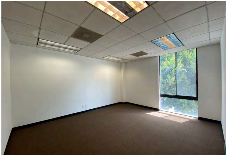
INTERIOR PHOTOS - SUITE 217