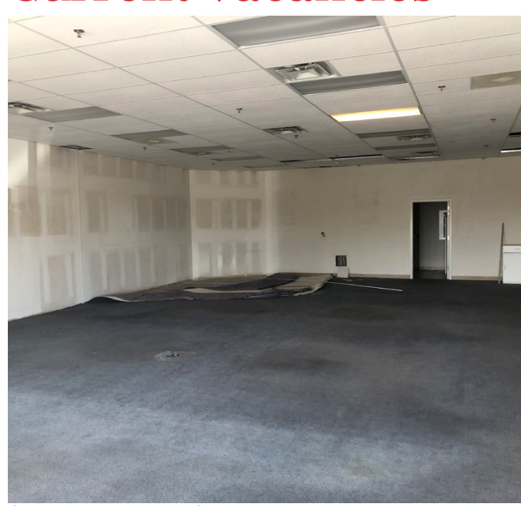
Suite B-10: 2,176 SF