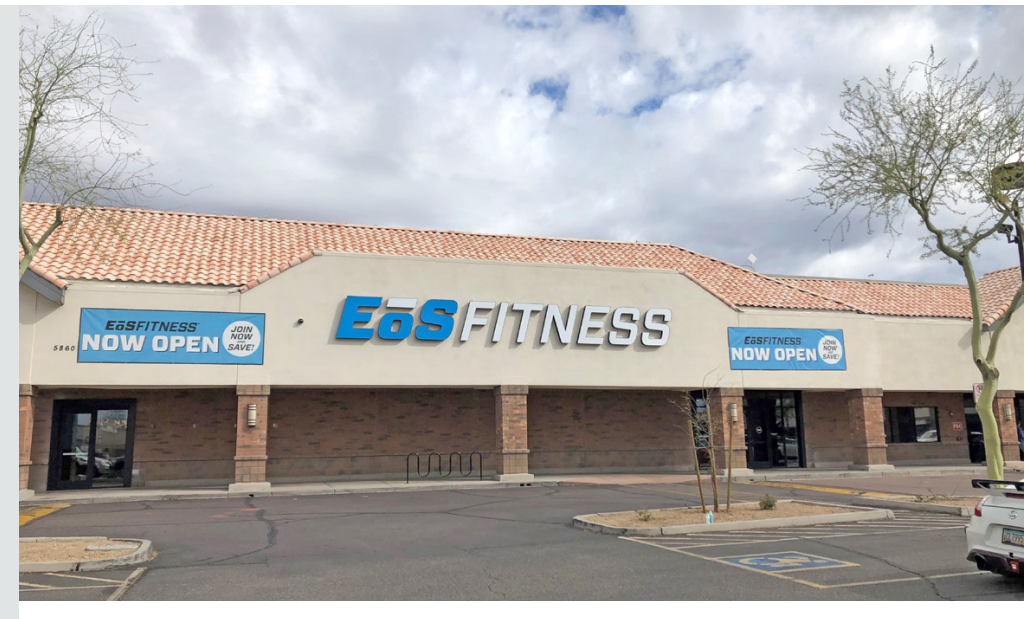
Join these co-tenants in the shopping center: