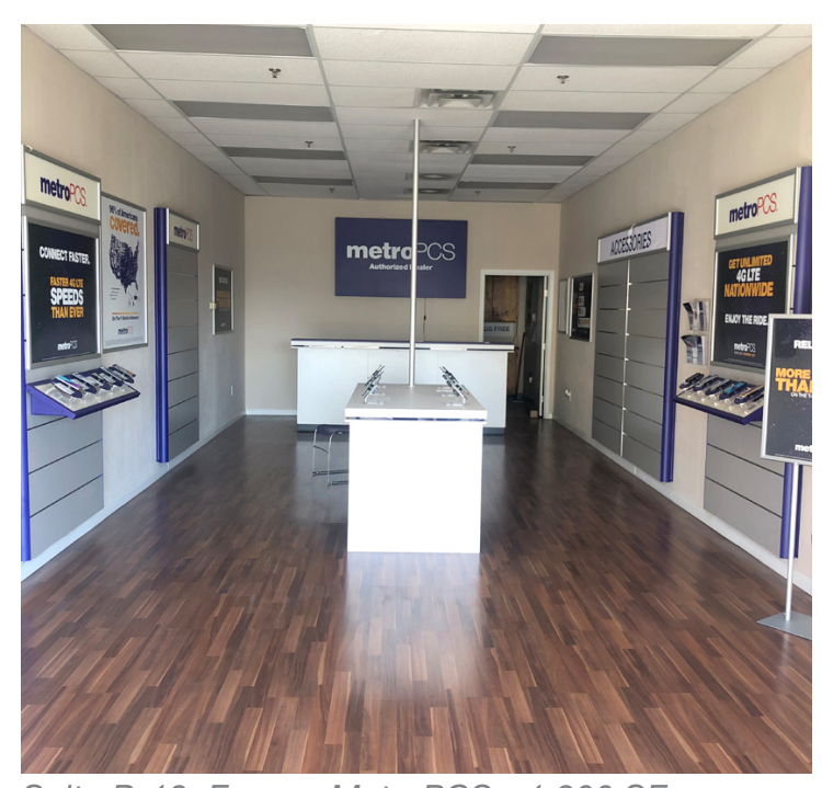
Suite B-12: Former MetroPCS - 1,200 SF