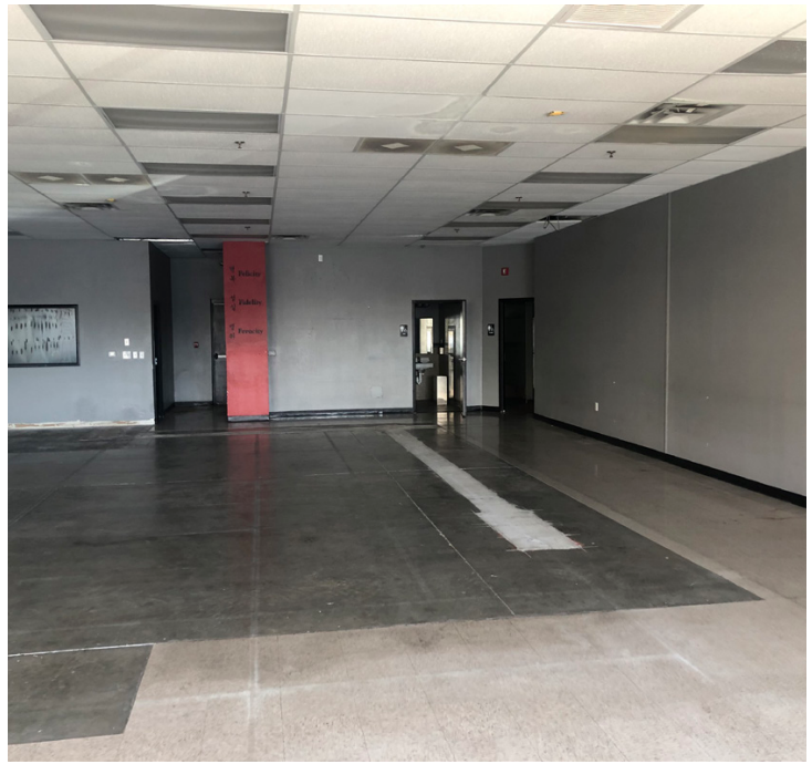
Suite B-11: Former Karate Studio - 2,138 SF