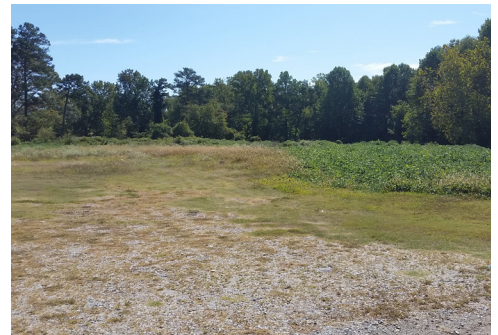
View of Property from Street