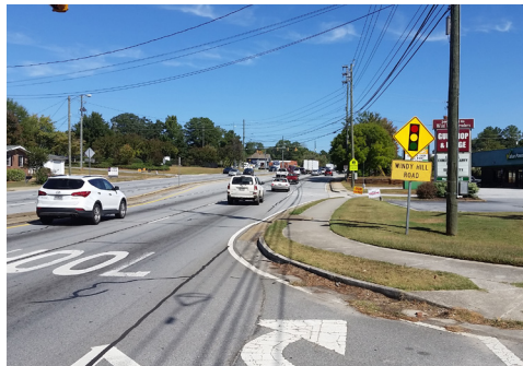
View from Property Looking North