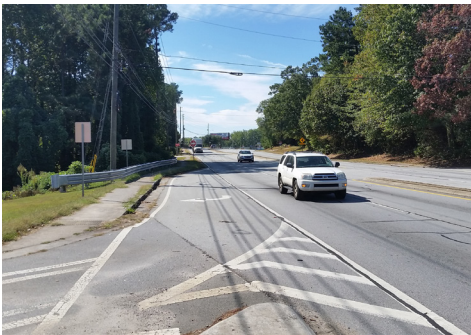
View from Property Looking South