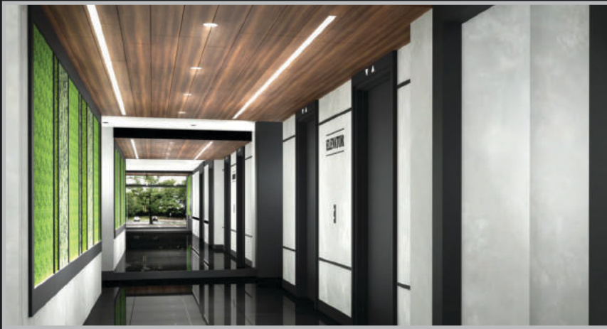
COMMON AREAS AND PROMINENT BUILDING SIGNAGE