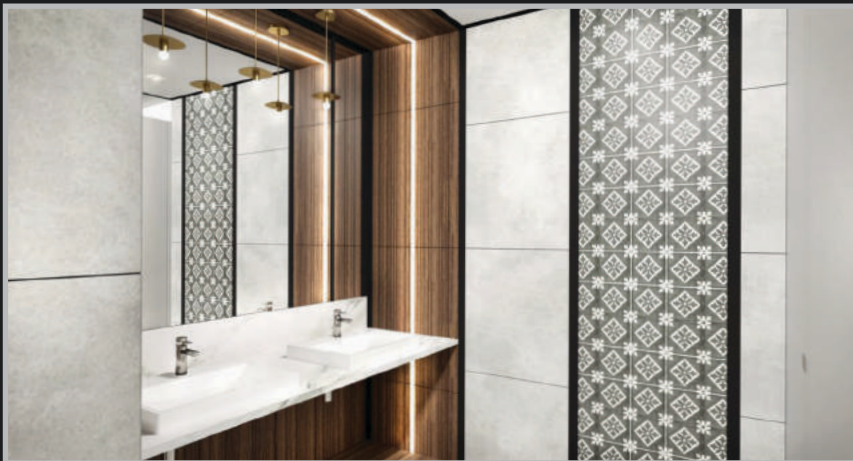
RESTROOMS WITH HIGH-END DECORATIVE FINISHES