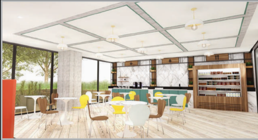
CAFÈ WITH INDOOR AND OUTDOOR SEATING