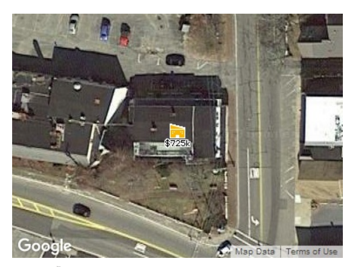
Legend: 👼 Subject Property