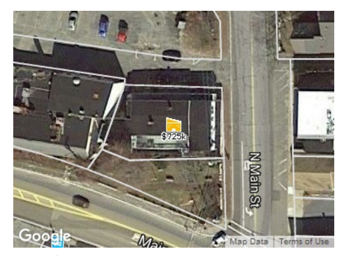
Legend: 👼 Subject Property