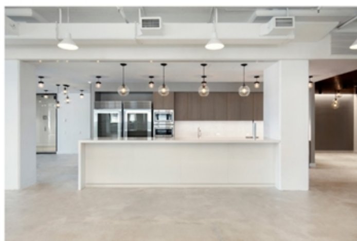
155 AOA Prebuilt Space