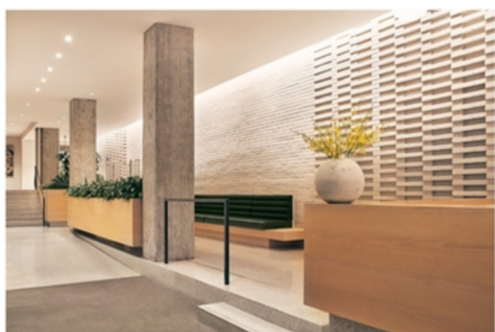
155 AOA Lobby