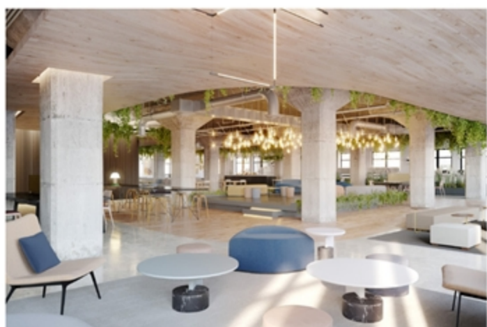
155 AOA Rendering of Potential Tenant Buildout