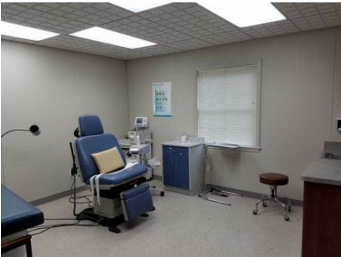
Interior Photo 2