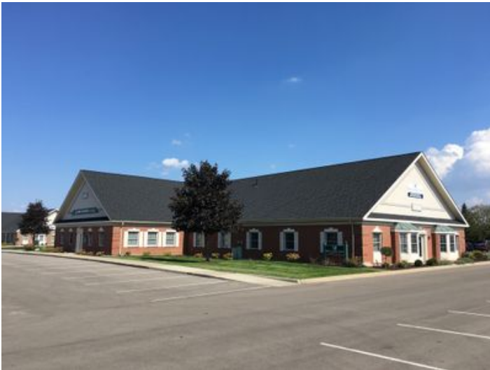
Building Photo 4