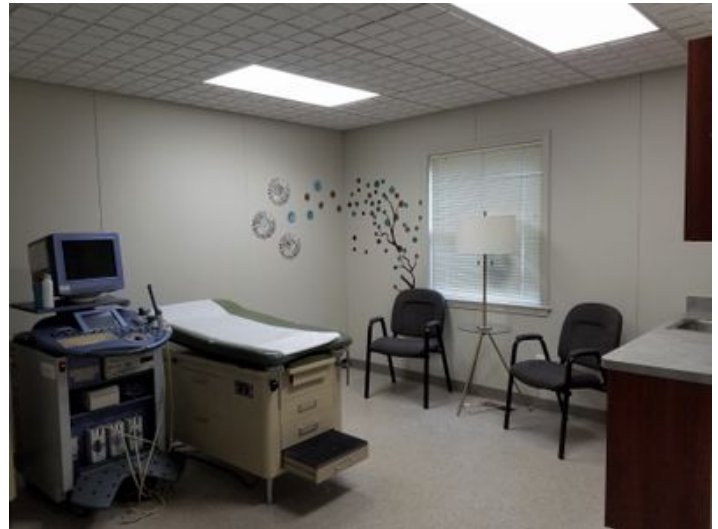
Interior Photo 3