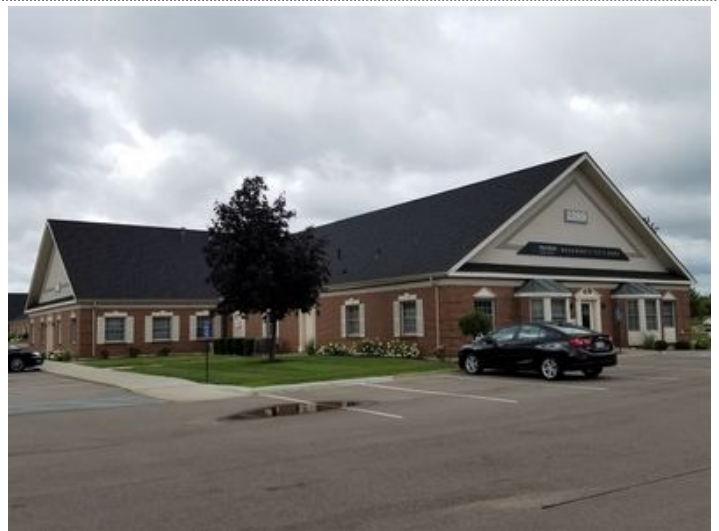
Building Photo 3