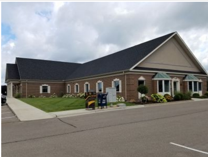
Building Photo 2