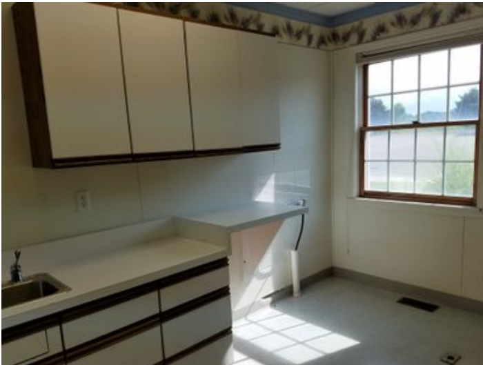
Interior Photo 1