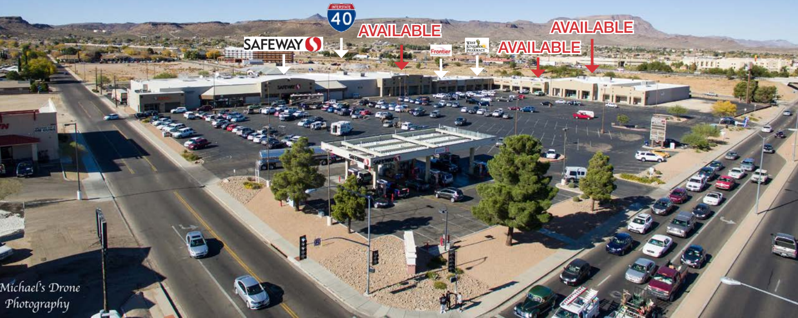
Michael's Drone Photography