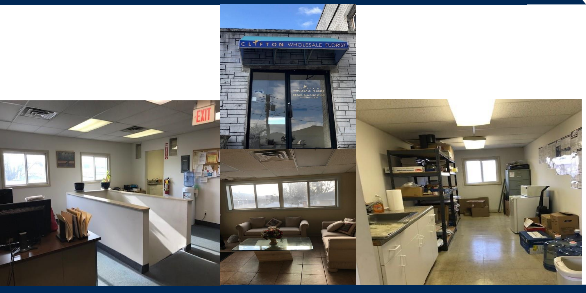
1400 SF FOR LEASE

2<sup>nd</sup> Floor Office Space Renovated with private bath