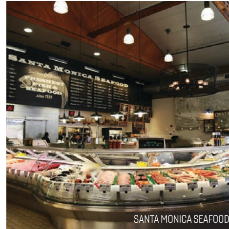
SANTA MONICA SEAFOOD