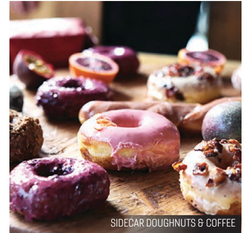
SIDECAR DOUGHNUTS & COFFEE