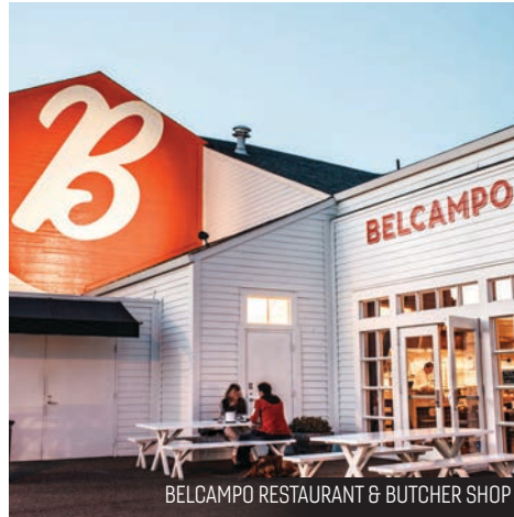
BELCAMPO RESTAURANT & BUTCHER SHOP