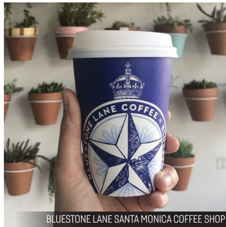
BLUESTONE LANE SANTA MONICA COFFEE SHOP