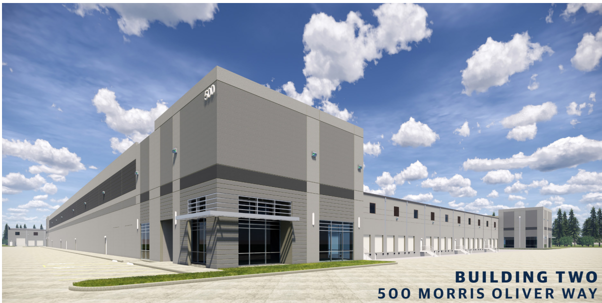
BUILDING TWO 500 MORRIS OLIVER WAY

RIVES NOLEN rnolen@insiterealty.com 713.339.5316