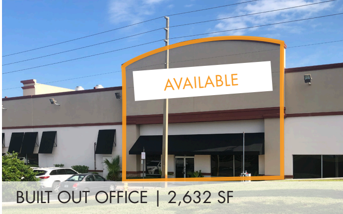
BUILT OUT OFFICE | 2,632 SF