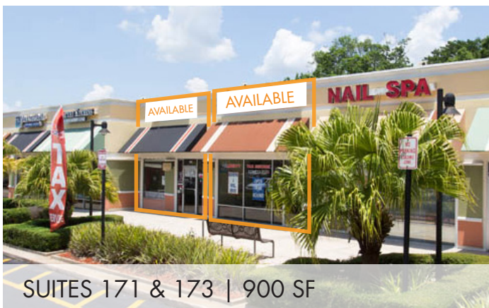
SUITES 171 & 173 | 900 SF