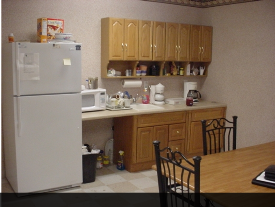
Break Room Area