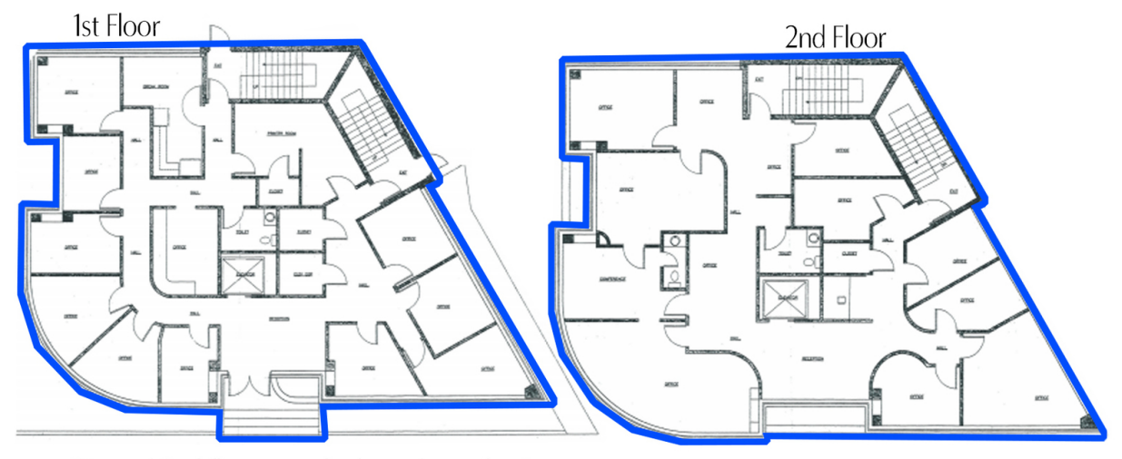
*1st and 2nd floor must be leased together*