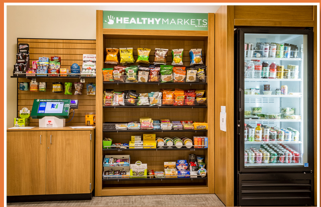
FRESH FOOD MICRO MARKET