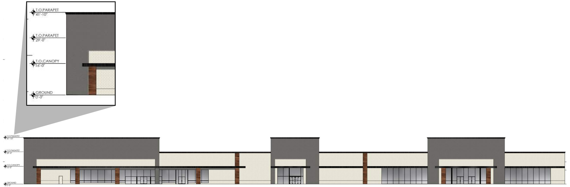
01 RENDERED EXTERIOR ELEVATION SCALE: 1/16" = 1'-0"