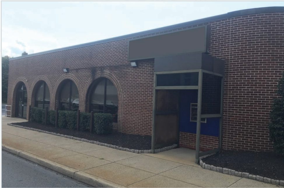
*DEMOGRAPHICS BASED ON A 5-MILE RADIUS