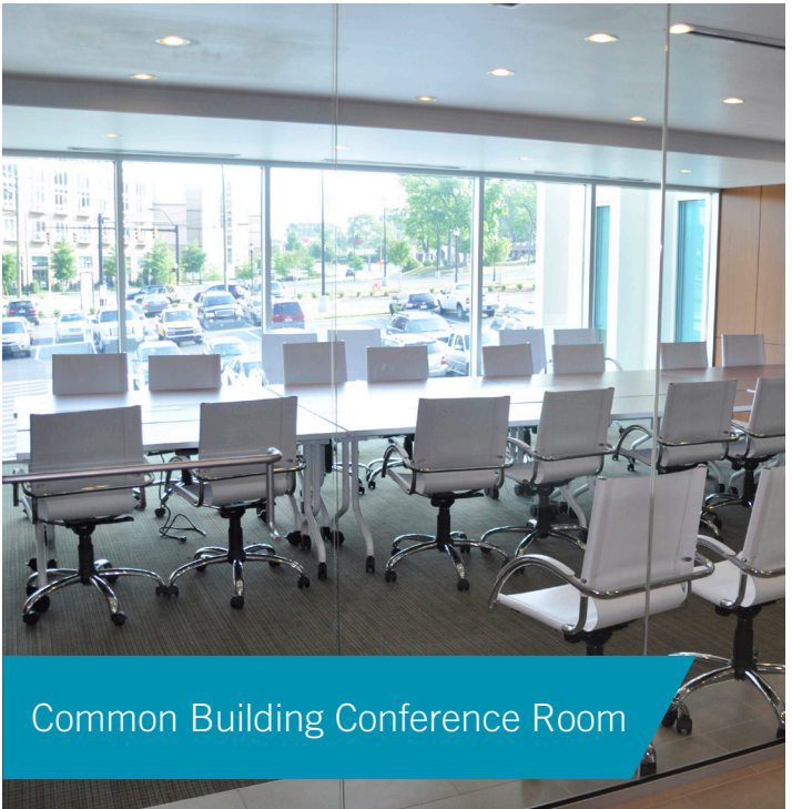
Common Building Conference Room