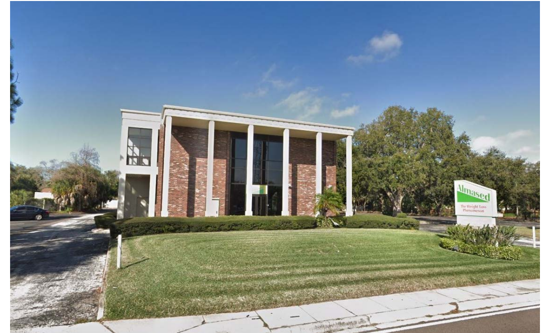
2861 34 th Street S., St. Petersburg, FL 33711