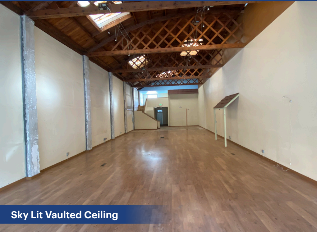
Sky Lit Vaulted Ceiling