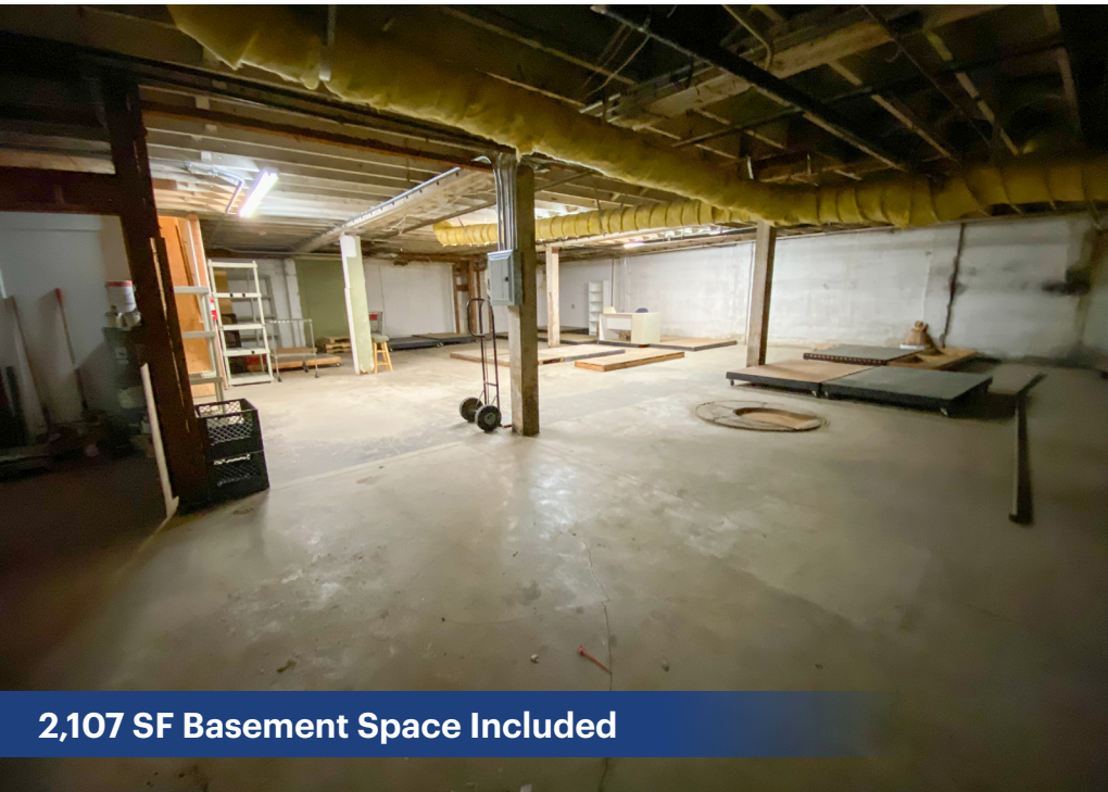
2,107 SF Basement Space Included