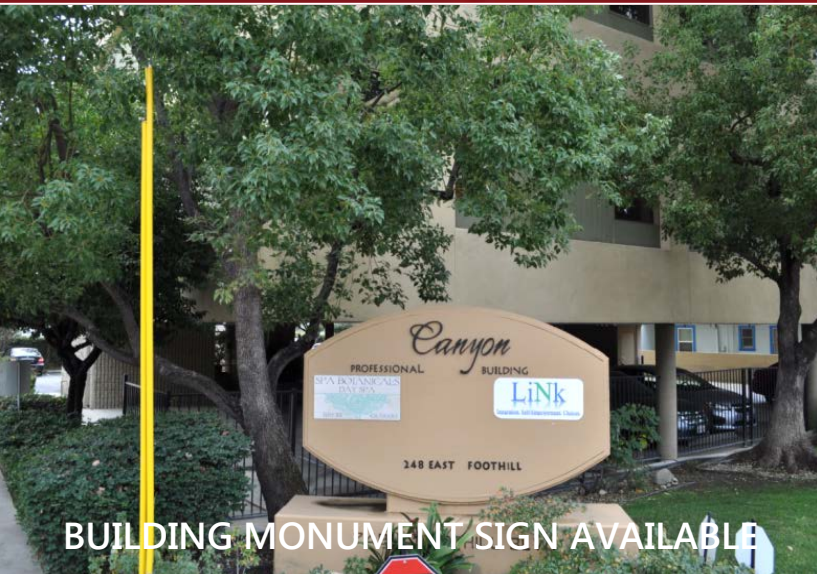
BUILDING MONUMENT SIGN AVAILABLE