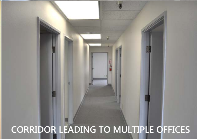
CORRIDOR LEADING TO MULTIPLE OFFICES