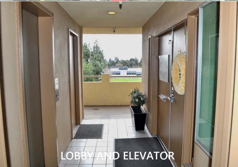
LOBBY AND ELEVATOR