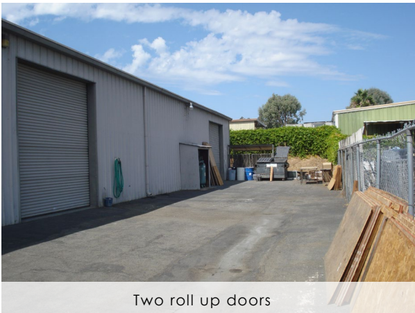
Two roll up doors