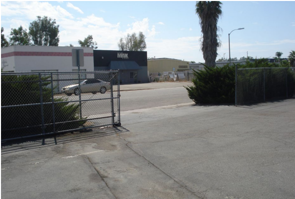
Fenced, secured parking / yard area