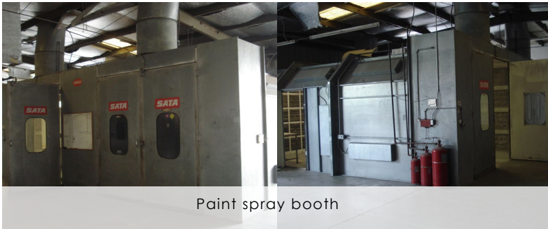
Paint spray booth