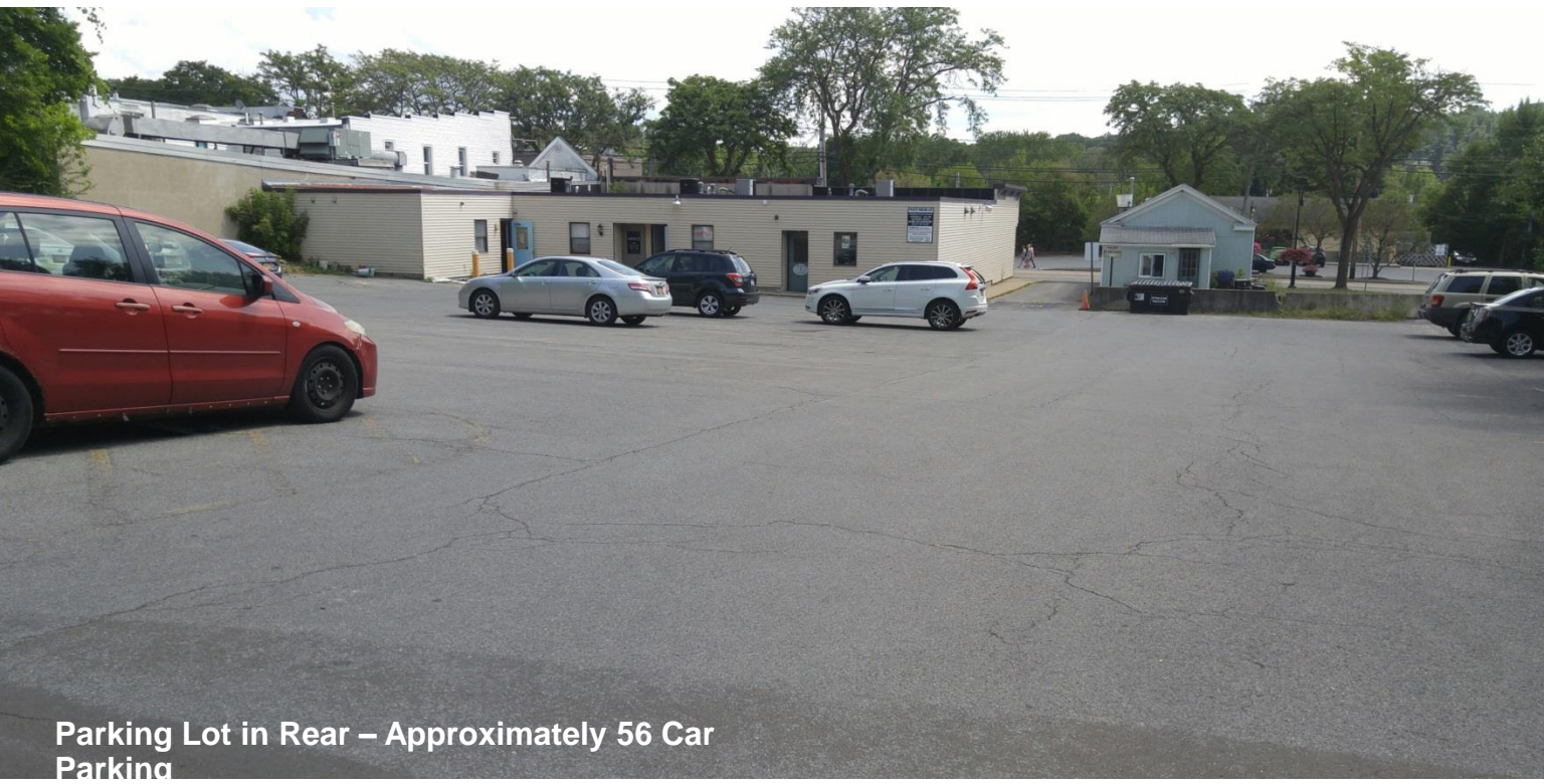
Parking Lot in Rear – Approximately 56 Car Parking