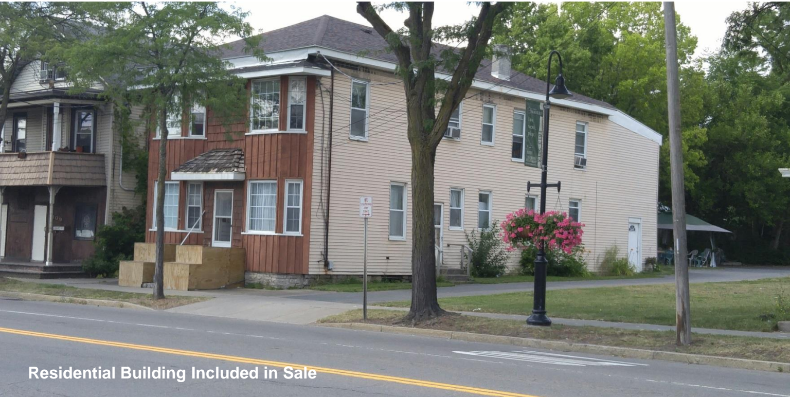
Residential Building Included in Sale