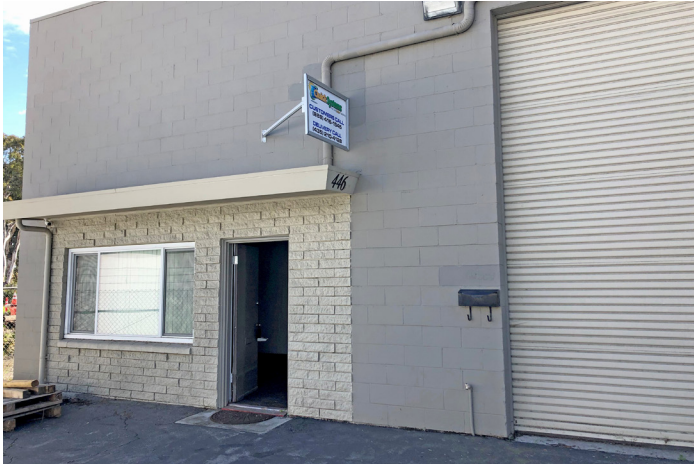
Not to scale / not exact