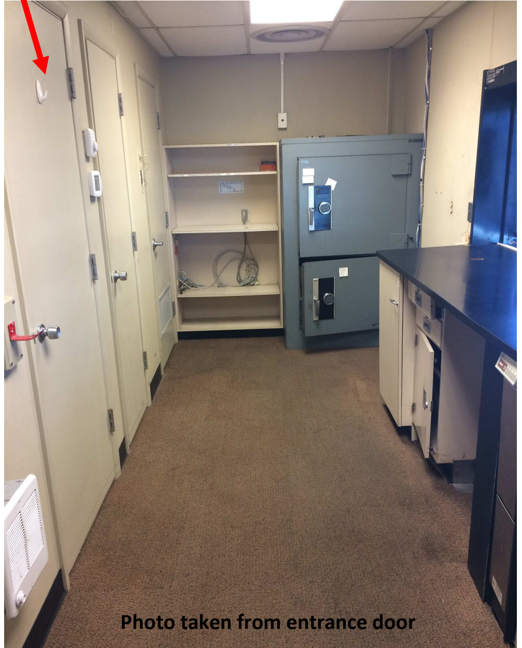
Photo taken from entrance door