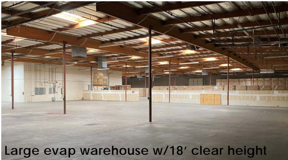
Large evap warehouse w/18' clear height