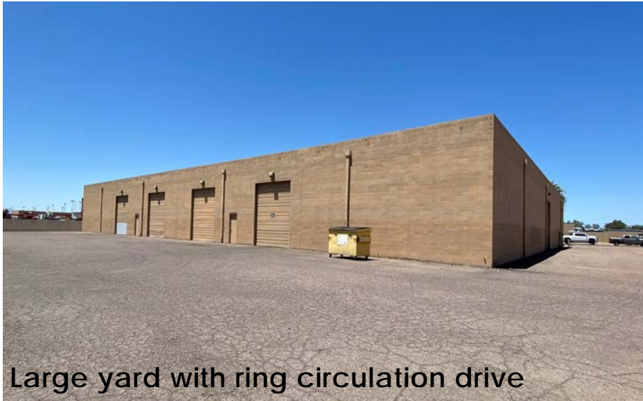
Large yard with ring circulation drive