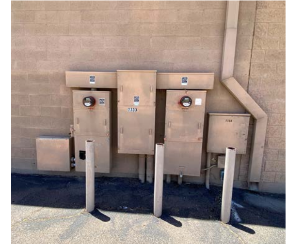
Service Entry Section