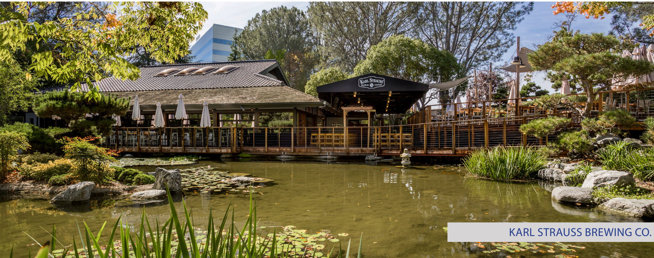
KARL STRAUSS BREWING CO.