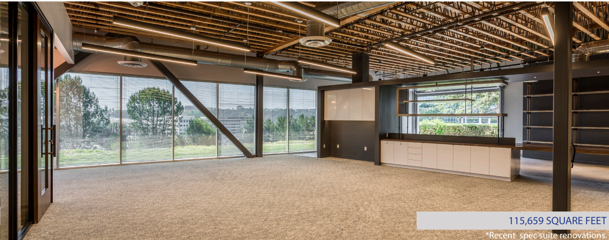
115,659 SQUARE FEET *Recent spec suite renovations.