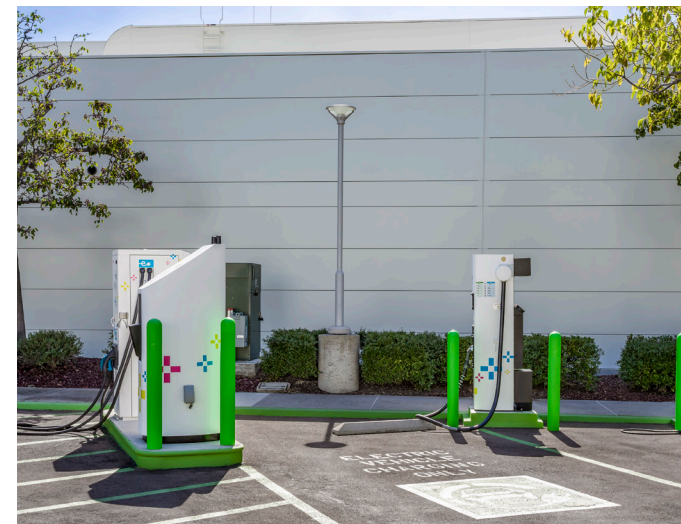
EV CHARGING STATIONS