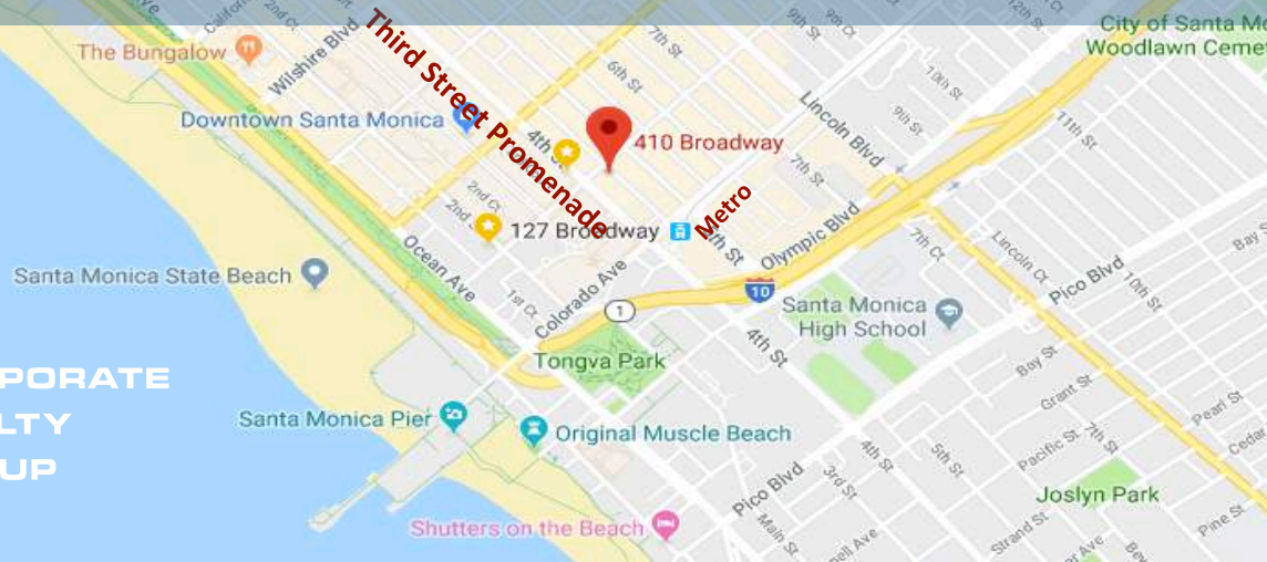
410 Broadway – Existing Layout