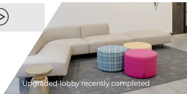
Upgraded lobby recently completed