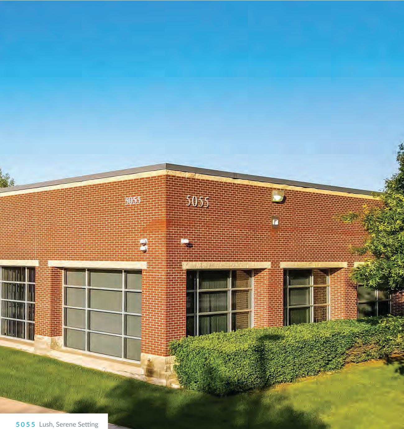
5055 Lush, Serene Setting