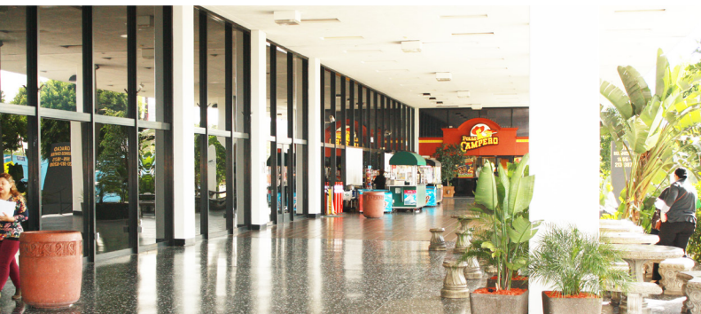
MEZZANINE STREET-LEVEL VIEW