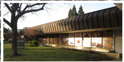
701 HOWE AVE.