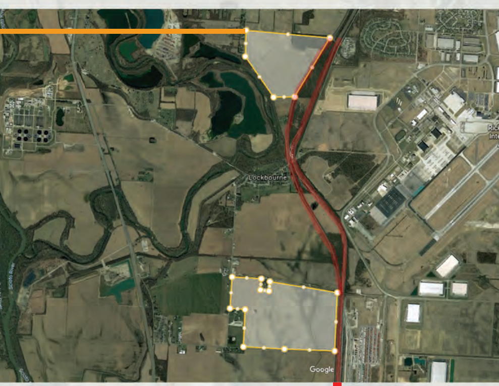
CSX Rail and Chessie RR System