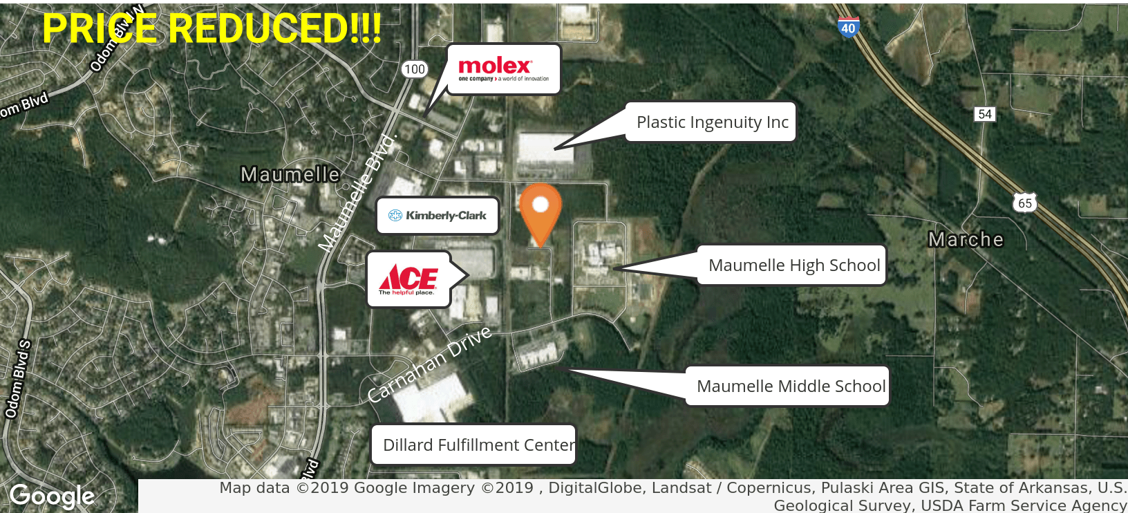
Map data ©2019 Google Imagery ©2019 , DigitalGlobe, Landsat / Copernicus, Pulaski Area GIS, State of Arkansas, U.S. Geological Survey, USDA Farm Service Agency